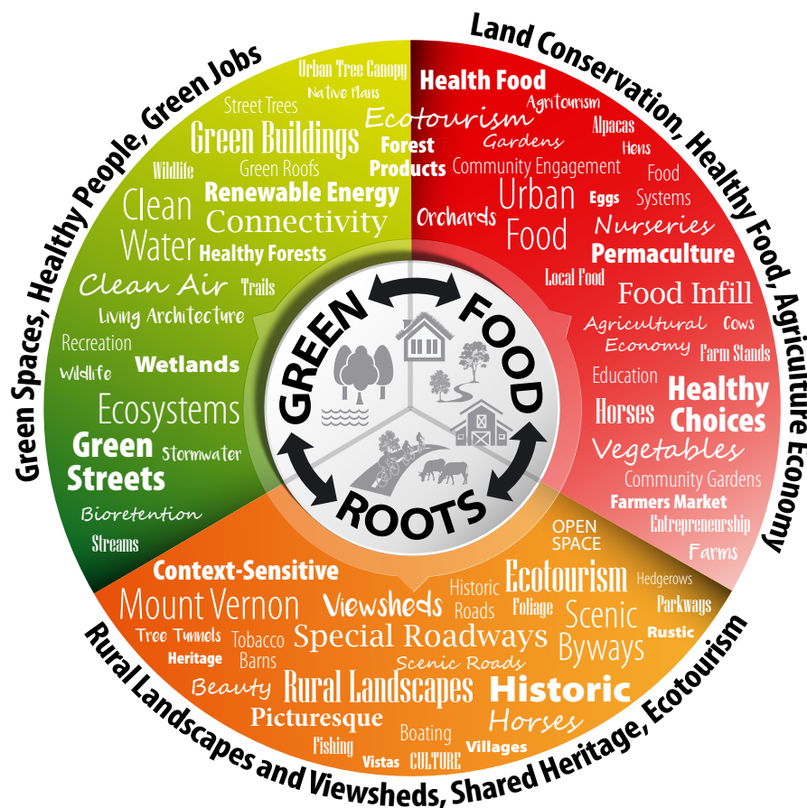
Figure 1. The Intersections and Contributions of the Three Plan Elements

The RCP includes the elements of green infrastructure, agriculture, and rural character as a platform for resilience needed to implement the desired development pattern of Plan 2035. As shown in Figure 1, these three elements are compatible and interrelated. Growing of forests supports the goals of green infrastructure preservation and the economic benefit of growing trees as an agricultural crop. Trees and forests clean the air, as does growing food close to where people live, because it reduces the miles food has to travel. Growing food near where people live means that healthy food is reaching people in their communities, providing choices for healthy living. Connected green infrastructure elements provide benefits not only to wildlife and plants, but also to people through cleaner air, cleaner water, and cooler communities.