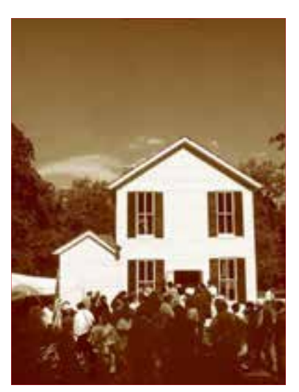
COVER: Rededication of Abraham Hall, 1991. (Historic Site 62-23-7. See page 55.)